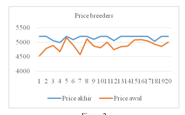
Figure 2 Optimum price for all DMUs on dairy farmers

In Figures 3, 4, and 5, the optimum price shown is lower than the current price, this happens as a result of an unbalanced distribution of risk. In Figure 3, obtained the optimum price to maximize profit is Rp 5.383. Figure 4 which shows the optimum price for the dadih producer is Rp 10,000 and Figure 5 gives the optimum price for the dadih retailer of Rp 11,000.