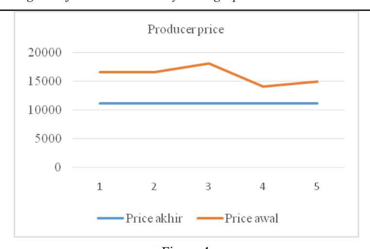
Figure 4 Optimum price of each DMU on the producers of dadih