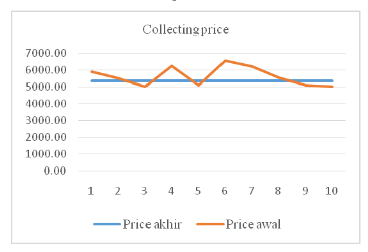
Figure 3 Optimum price for all DMUs in milk collectors

In Figures 3, 4, and 5, the optimum price shown is lower than the current price, this happens as a result of an unbalanced distribution of risk. In Figure 3, obtained the optimum price to maximize profit is Rp 5.383. Figure 4 which shows the optimum price for the dadih producer is Rp 10,000 and Figure 5 gives the optimum price for the dadih retailer of Rp 11,000.