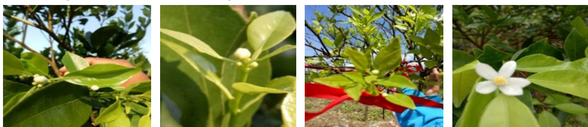
Figure 5. Picture of the flowering of the Siam citrus plant

The seasonal nature of fruit plants occurring in tropical climates is caused by several things: (1) flowering induction naturally occurs only in the highlands or lowlands with specific air temperature and long dry periods; and (2) flowering efficiency and fertilization is low, because the beginning of fruiting is uncertain and the nature of biennial bearing. according to [3] annual biennial bearings are flowering and fruiting nature that is unstable or fruitful in one year (on year) and fruitless the next season. The picture of flowering process on Siamese citrus plant during one period of its growth in Catur Village, Kintamani District, Bangli 2016.