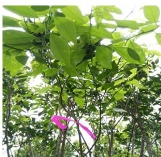
Figure 1. Initial shoots

Observation on shoot growth is done every 2 days. The signs shown in early repayment are from the period when the base of the terminal leaf pair at the end of the branch begins to rupture and then the bud leaves with the unopened candidate until the leaf pair has opened the time required for the initial repayment period is the average amount 6.87/tree observation at 2 weeks, 15.58 shoots/tree, 26.78 shoots /tree, 38.87 tree shoots and 57.09 shoot/tree. observation tree 4 weeks. The second morphological character is characterized by periods ranging from color Leaves are light green transparent long period of time required is yellowish on shoots then turns to light green with long transparent green leaf the period of time required is during observation tree 12 weeks (Figure 2).