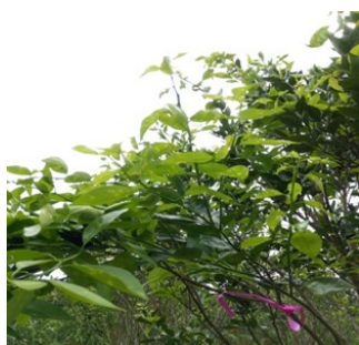
Figure 3. Adult shoots

The third phase of shoot growth in conjugated jeans is the phase of adult shoots, with the marks being fined from the leaves originally yellowish green, then turning dark green, the time taken.