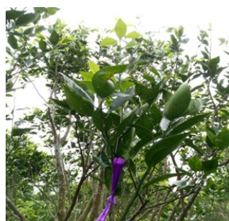
Figure 4. Shoots dormancy

The flowering period of citrus plants is characterized by morphological features, among others: the change of leaves is from dark green leaves, then there is a change in the color of light green leaves transparent, then followed by changes in the start of the candidate will flower with signs of bulging on the surface of leaf bud . The development of citrus flower shoots consists of four phases when viewed morphologically include: 1) induction phase, visual observation has not occurred changes in the shoots or armpits of plants, 2) defferensation, marked by the emergence of buds on the armpits, 3) began to appear flower nipple on shoots and flowers begin to blossom (Figure 5). Morphology of the development of orange plant flowers). Flowering process that begins when the armpits/shoots of dormant leaves to be induced into flowers, often do not occur in the whole armpits/buds flowering process contains a number of important stages, all of which must be successfully held to obtain fruit. In accordance with the opinion of [7] the stages of the development of flowers include the induction of flowers (avocation), the initiation of flowers, the development of flower buds to an-