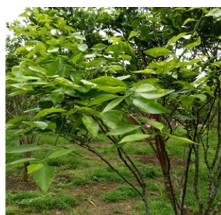
Figure 2. Full shoots

The third phase of shoot growth in conjugated jeans is the phase of adult shoots, with the marks being fined from the leaves originally yellowish green, then turning dark green, the time taken.