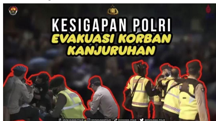
Figure 1. Screenshot of Divhumas Polri Video