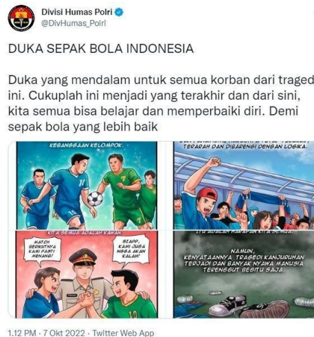
Figure 2. Post DivHumas Polri

the field who became victims of their own actions. The choice of diction used is chaos, riot, instead of police negligence or error. In another upload on 7 October 2022, the National Police Public Relations Division raised a picture story with the title "The Sorrow of Indonesian Football. According to Gulam & Sahroji (2022), the Kanjuruhan tragedy would not act fanatically. The illustration reads "fanaticism should remain measured, directed, and accompanied by logic."