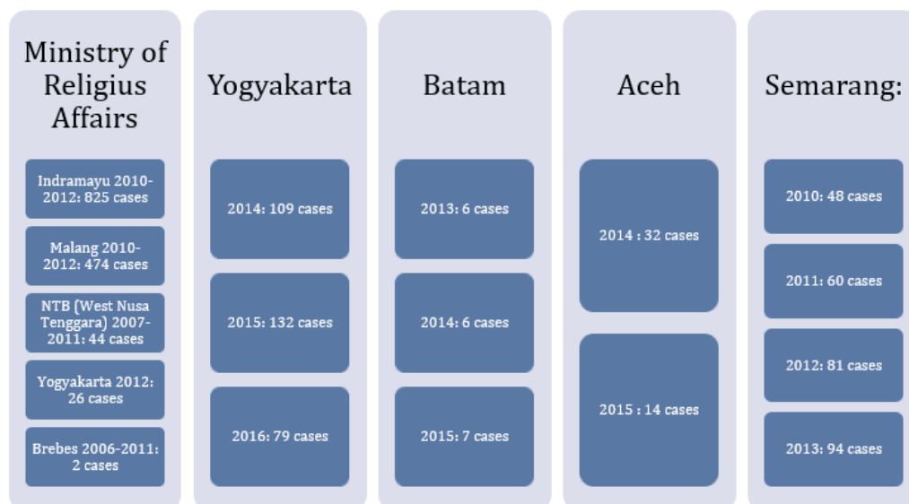
Figure 4 Data on Marriage Dispensation

Presidential Instruction No. 1 of 1991 on the Kumpulan Hukum Islam (KHI) Article 15 states that the age limit of marriage is the same as Article 7 of Law No. 1 of 1974, but with additional reasons: for the benefit of families and households .