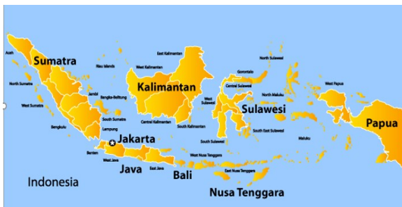
Figure 1 1 Indonesian Maps

Indonesia is a large nation located in Southeast Asia region. As a large nation, Indonesia consists of numerous islands consisting of Sumatra, Java, Kalimantan, Sulawesi, Papua and many more. In Indonesia, there is a huge diversity between one region and another in terms of ethnicity, culture, religion, and language. Even so, no problem arises since the