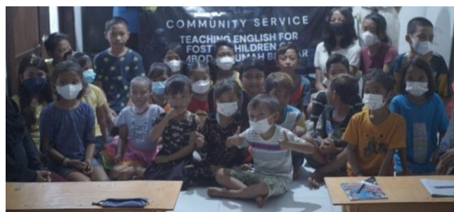
Figure 3. Children in Suwung Village