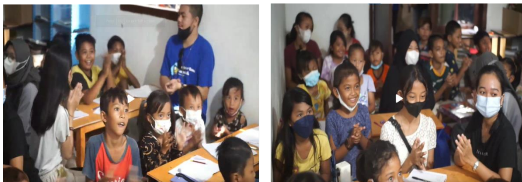
Figure 5. Ice-breaking in the form of a song