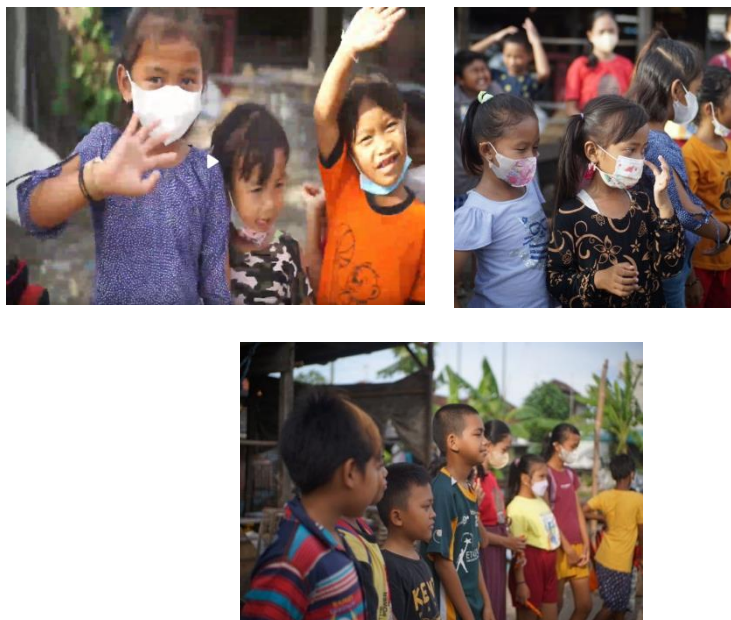
Figure 4. Ice breaking in the form of a game