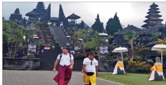
Picture 1. 2020 tourist visit in Besakih Village, Karangasem regency after the COVID-19 pandemic