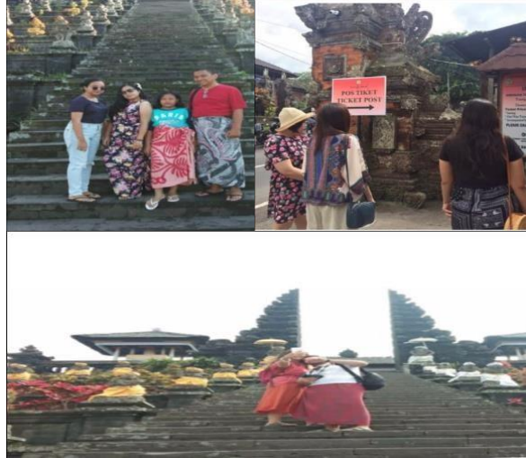
Picture 2.1 2021 tourist visit in Besakih Village, Karangasem Regency as a post-implementation promotion strategy

Based on the results of the data research above, it can be concluded that the promotion strategy of the Besakih Village tourism office in increasing the number of tourists each week has increased this can be seen from the Besakih Village tourist visit data in the graph above.