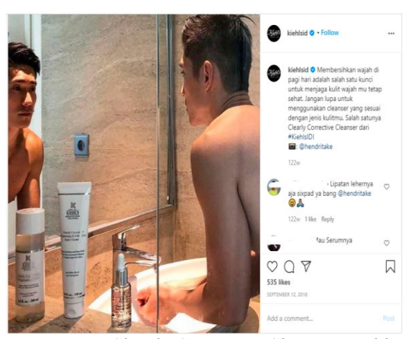
Figure K.3. Clearly Corrective Cleanser Kiehl's Ads

Figure K.3 which visualizes a man in the mirror equipped with three skincare products. They are all Clearly Corrective Cleanser products. The object of a man standing in front of the mirror without his clothes on, more often said to be topless or shirtless shows that he is looking at his image just before cleaning his face. The reflection of the mirror shows the facial expression of the man in the picture ready to carry out cleaning activities with a set of skincare products earlier. The image features muscular arms which is one of the benchmarks for what he calls a masculine man to be clearly exposed. Figure K.3 indirectly communicates to potential consumers that muscular men, who are more like sports-loving and hardworking men, are also recommended to get regular and good other facial treatments. In words. this advertisement tries to reconstruct masculinity of men who are closer to strenuous activities and far from facial treatments, to become men who pay more attention to the health of their skin even though they have to do heavy activities or exercise.