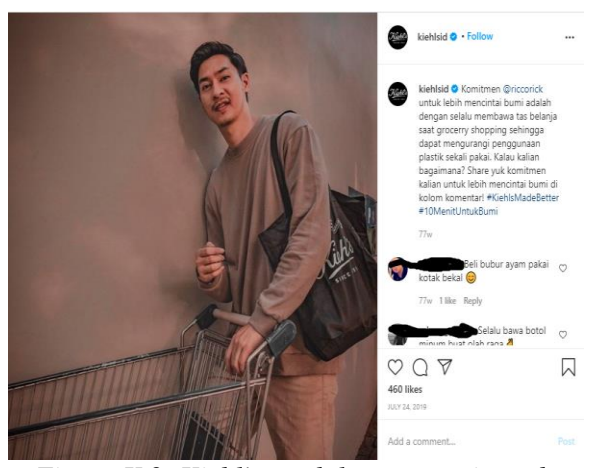
Figure K.2. Kiehl's earth love campaign ads

As visualized in Figure K.2, a graphic designer as well as a celebrity @riccorick who has a hobby of traveling is described as if someone is going shopping. He is also quipped with a market trolley and an eco bag or better known as a tote bag or black cloth bag with the Kiehl's brand label. The relaxed standing pose shows that the model in the advertisement carries out shopping activities comfortably. Using plain t-shirts and matching pants adds a casual impression, so overall the ad represents a