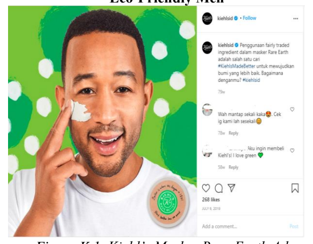
Figure K.1. Kiehl's Masker Rare Earth Ads