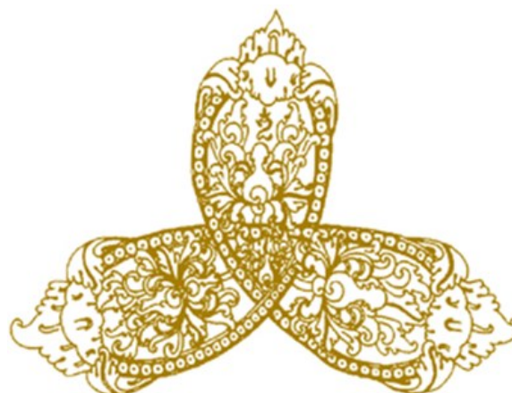
Picture 1. Tri Hita Karana

Tri Hita Karana 's lexicon belongs to the noun category. Morphologically, the triangular lexicon of karana consists of three leksem tri 'three', hita 'prosperity', karana 'cause' so it belongs to the form of compound word. Eoleksically belong to abiotik kelempek. Tri Hita Karana consists of three elements namely atma 'spirit', prana 'force', and 'body' angga . All three are categorized into the noun category and are the basic word form. Tri Hita Karana 's lexicon of the noun category is usually spoken by the elder or the elder. The speaking partner of this lexicon speaker is equivalent or younger than the speaker. This lexicon is spoken in a situation of giving advice. By using Tri Hita Karana object that is three relationships of harmony with God, fellow human and nature. The speaker gives advice that his younger partner can run the concept of Tri Hita Karana in his life.