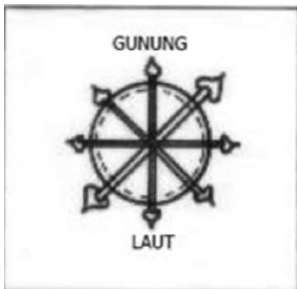
Gambar 4. Sanga Mandala

In terms of its categorization, the lexicon of sanga mandala is categorized in the noun category. The lexicon of sanga mandala is a compound form because it consists of two leksem namely sanga 'nine' mandala 'territory'. The lomaikon sanga mandala in ekoleksikal pertained in abiotic or lifeless environment. The sanga mandala that is categorized as noun is usually spoken by the elders or the elder. The speaking partner of this lexicon speaker is equivalent or younger than the speaker. This lexicon is said in situations of guidance or direction. By using the object sanga mandala is the concept of space in the traditional settlement of Bali. The speaker gives guidance or direction so that his or her younger equivalent or equivalent counterparts can apply the concept of sanga mandala so that in the making of residential house the division of residential zone can run harmoniously.