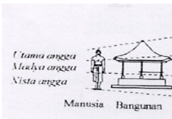
Picture 2. Tri Angga

rized in the noun category. In an ecological triangle lexicon is included in the abiotic or lifeless category. The tri-lexicon of a categorized noun is usually preached by an elder or an elder. The speaking partner of this lexicon speaker is equivalent or younger than the speaker. This lexicon is said in situations of guidance or direction. By using a tri angga object that is three zones within the holder. The speaker gives guidance or direction so that his or her younger partner or equivalent with the speaker can apply the concept of tri angga so that in making the residential house the settlement zone can run harmoniously.