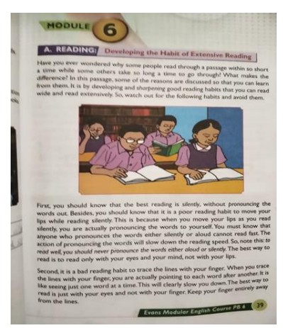
Fig 4.3: Showing a reading comprehension passage

Social semiotics, as proposed by Kress (2012), involves analyzing the virtual and linguistic elements present in texts to understand how they create meanings. These elements encompass various modes such as color, size, font size, mapping, logos, and images. In essence, social semiotics explores how different visual and textual elements within a text work together to convey messages and shape our understanding of the world around us. It provides a framework for examining the ways in which these elements interact to create meaning and communicate ideas to the audience. In the context of analyzing English textbooks for basic pupils, Kress's social semiotics helps us understand how various design elements contribute to the overall meaning conveyed by the text. For example, the use of display font and color on the textbook cover page not only enhances visual appeal but also serves to grab the reader's attention and convey the importance of the title.