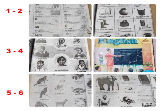
Fig 4.4: Images showing letters of the alphabet, animate and inanimate objects

Comprehension refers to the ability to process written text, understand its meaning and integrate it with what the reader already knows. It also involves the complex cognitive process which involves an intentional interaction between reader and text in order to extract meaning. In the figure below, several semiotic resources which contribute to the meaning potentials of the texts are found in basic pupils' English textbooks under discussion.