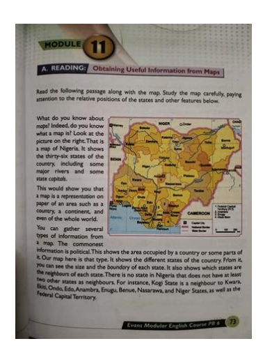
Fig. 4.2: Showing an image of the map of Nigeria