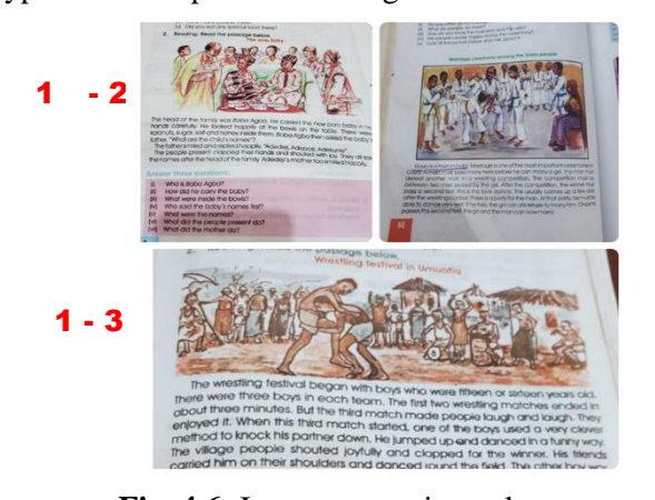
Fig. 4.6: Image portraying culture

Culture is regarded as the customary beliefs, social forms, and material traits of a racial, religious or social group. Also, culture is a set of patterns of behaviour that people exhibit within a community or social group as well as the symbolic frameworks that interpret these behaviors. Culture in other words is peoples' way of life, behaviours, beliefs and values. All of these elements are passed across with the use of language. The Figure below is an example of a typical culture practised in Nigeria.