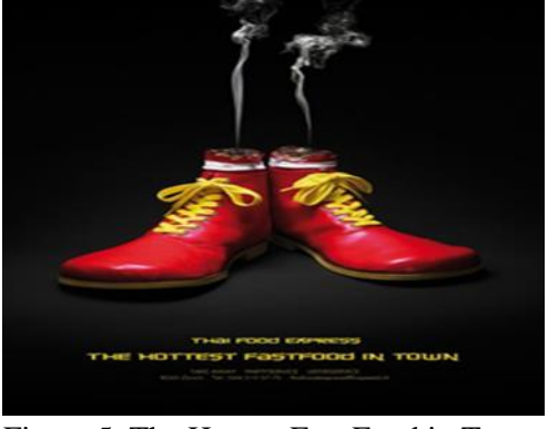
Figure 5. The Hottest Fast Food in Town

According to Gill (2002), Distribution refers to the portrayal of the sequence, end result, or a new aspect of the process or phenomenon presented in one mode by other one. Figure 5 is an Ad for a fast food restaurant where hot and chili food is served. The image portrays the result of having chili food at this restaurant. In a hyperbolic way, empty shoes show that the person in them is burnt as a result of eating chili food.