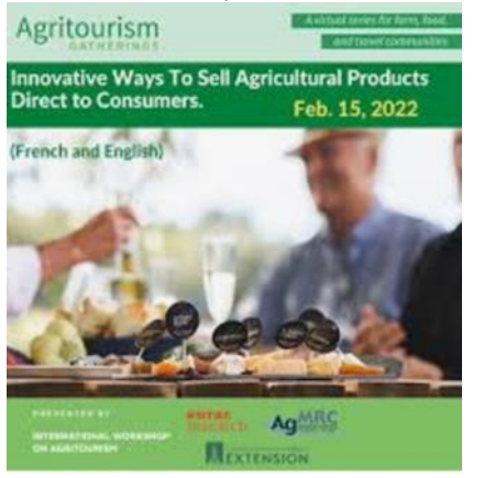
Figure 4. Innovative Ways to Sell Agricultural Products Direct to Consumers

of the place, together with circumstance, people, and the products to be sold enhances the text by specifying the exhibition conditions. By so doing, the designer adds some new elements like participants, place, and condition to non-verbal mode to qualify it circumstantially to increase the effectiveness of the Ad. Both verbal and visual modes are closely related.