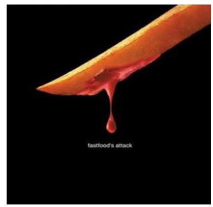
Figure 2. Fast-Food's Attack

between image and text by which the whole text relates to the whole image in such a way that image and text are equal and independent. In Figure 2, which is designed to inform the audience about the dangers of excessive consumption of fast food, the photo and the text both convey the same meaning to the audience. The 'Fast-Food's Attack' written in the text is depicted in the photo with a piece of fried potato; in order to portray 'Attack' in the image, fried potato is illustrated in the shape of a knife blade from which a drop of ketchup sauce is dripping like blood. Both image and text have the same level of generality. Photo and text are independent of each other since the words of the text 'Fastfood' and 'Attack' are portrayed in the image. This equal level of generality is manifested by way of synonymy to convey the same message via different channels.