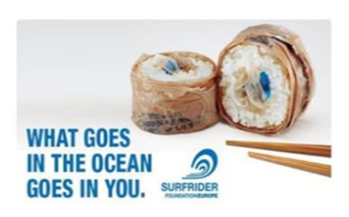
Figure 3. What Goes in the Ocean Goes in You

a majority of possible problems caused by polluted ocean, the designer has tried to better express the depth of the tragedy by representing an example of this danger threatening humans and the environment to make message more tangible. As can be seen, the image depicts part of the phenomenon described in the text. Photo shows a kind of seafood, sushi, rolled out of trash that might be found in the ocean. In fact, the image retells what is expressed in the text from a narrow perspective using other meaning-making resources. Actually, it expresses the desired message in more detail, though it does not have the level of generality of the text.