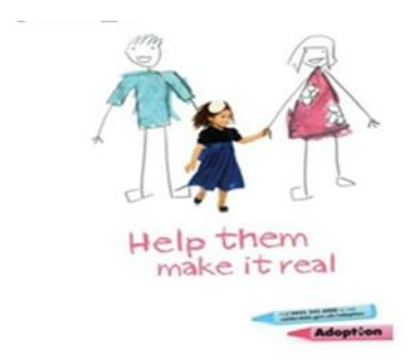
Figure 6. Help Them Make It Real Finally, projection, encompassing 6.66% of English Ads, is another sub-category of Martinec and Salway's (2005) intermodal relation taxonomy, with two sub-types, namely: Locution and Idea. In this type there is usually a sentence

Augmentation involves adding new information by one mode to the other by representing important segments of the meaning that makes interpretation possible. Augmentation can be realized by providing new and additional ideational elements such as participants and circumstances which are vital to make and convey meaning (Martinec and Salway, 2005). The purpose of the Ad in Figure 6 is to promote child adoption and to help children have a real family. At first glance, the reader may not realize the message of the text. Who is "Them"? Who is asked to "Help"? What is supposed to be made "Real"? The answers to these questions are important elements without which interpretation of the text might be impossible. The image provides some ideational elements such as participants and conditions to complement and extend the text to convey the message better. The real image of a child and two childish drawings of a woman and a man next to the child, make it clear that the message is about children waiting to be adopted. The man and the woman in the photo are the kid's dream parents, which are the people who are asked to help these children make their dreams of having a real family real. The interesting combination of image and text in this ad has doubled the power of the message.