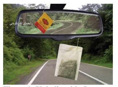
Figure 9. Unbelievable Scent

Exposition, a sub-category of Elaboration, includes text and image which are of the same generality (Martinec & Salway, 2005). In Figure 9, there is a tea bag hanging from the front mirror of a car instead of a car air fresher. The sentence of the Ad says: "Unbelievable Scent" (حايحه). This sentence wants to inform the audience that the aroma of this type of tea bag is so pleasant that it can be used instead of air fresher in the car.