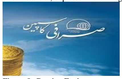
Figure 8. Caspian Exchange

Exemplification is a kind of image-text relation in which either text or image is more general (Martinec & Salway, 2005). Figure 8 is an Ad for an exchange office. Exchange offices offer a variety of monetary, banking, and foreign exchange services and deal with various currencies. From all these items, only one example (coins) can be seen in the image, located in the corner of the photo and a little outside the image border. There is no other example or additional information, ideational and circumstantial, depicted in the image.